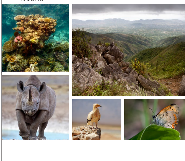
IUCN (2016) A Global Standard for the Identification of Key Biodiversity Areas, Version 1.0. First edition. Gland, Switzerland: IUCN.

A Global Standard for the Identification of Key Biodiversity Areas establishes a consultative, science-based process for KBA identification, founded on a standard methodology. It builds on four decades of experience in identifying important sites for different subsets of biodiversity, including Important Bird and Biodiversity Areas, Alliance for Zero Extinction sites, Important Plant Areas, Prime Butterfly Areas, and key biodiversity areas for freshwater and marine species. The KBA Standard harmonises these existing approaches and provides a common currency for the identification and safeguard of sites important for threatened biodiversity, geographically restricted biodiversity, ecological integrity and ecosystem intactness, biological processes, and irreplaceability in terrestrial, inland water, and marine environments.