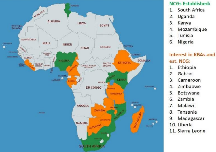
Figure 1: African countries interested in or active with KBAs, e.g. establishing National Coordination Groups.

While it is a global programme, KBA identification is a bottom-up process, largely driven by local organizations and experts through KBA NCGs; which is an essential characteristic to ensure the future safeguard and conservation of these sites. KBA data, stored on the World Database of Key Biodiversity Areas, are being used in many different ways to promote biodiversity conservation and sustainable development.