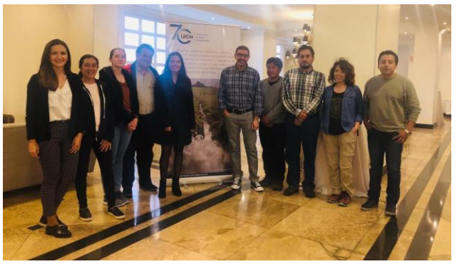
Photo 2 and 3: Key Biodiversity Areas workshops in April 2019 in Bogota and Quito.

In Paraguay, the BirdLife International Partner (Guyra Paraguay), WCS Paraguay and WWF Paraguay have joined the Ministry of the Environment and Sustainable Development to advance the official recognition of KBAs and begin establishing the National Coordination Group (NCG). The event was attended remotely by the IUCN and NatureServe whose representatives kindly shared the experience gained in the Tropical Andes with KBA-related training events.