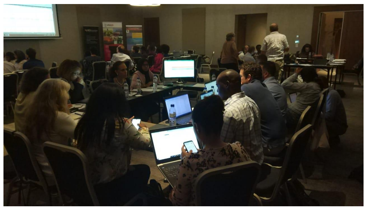
Photo 5: Workshopping ideas and exchanging knowledge about various taxa at the KBA delineation workshop