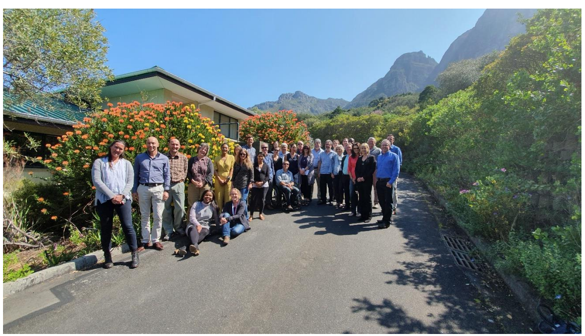
Photo 3: Participants who attended the 3<sup>rd</sup> KBA Review Stakeholder Workshop representing the various taxa experts, NCG members, and KBA Committee, KBA Technical Working Group and KBA Standards and Appeal Committee.

Mozambique continues to review and identify KBAs after initial training was given in May 2019. Recently they hosted a delineation workshop which started to map where future KBAs and likely protected areas will be designated. The Government of Mozambique, through the National Directorate of Environment and the Wildlife Conservation Society (WCS), funded by USAID (SPEED+ project) have been identifying and mapping KBAs in the country and various working