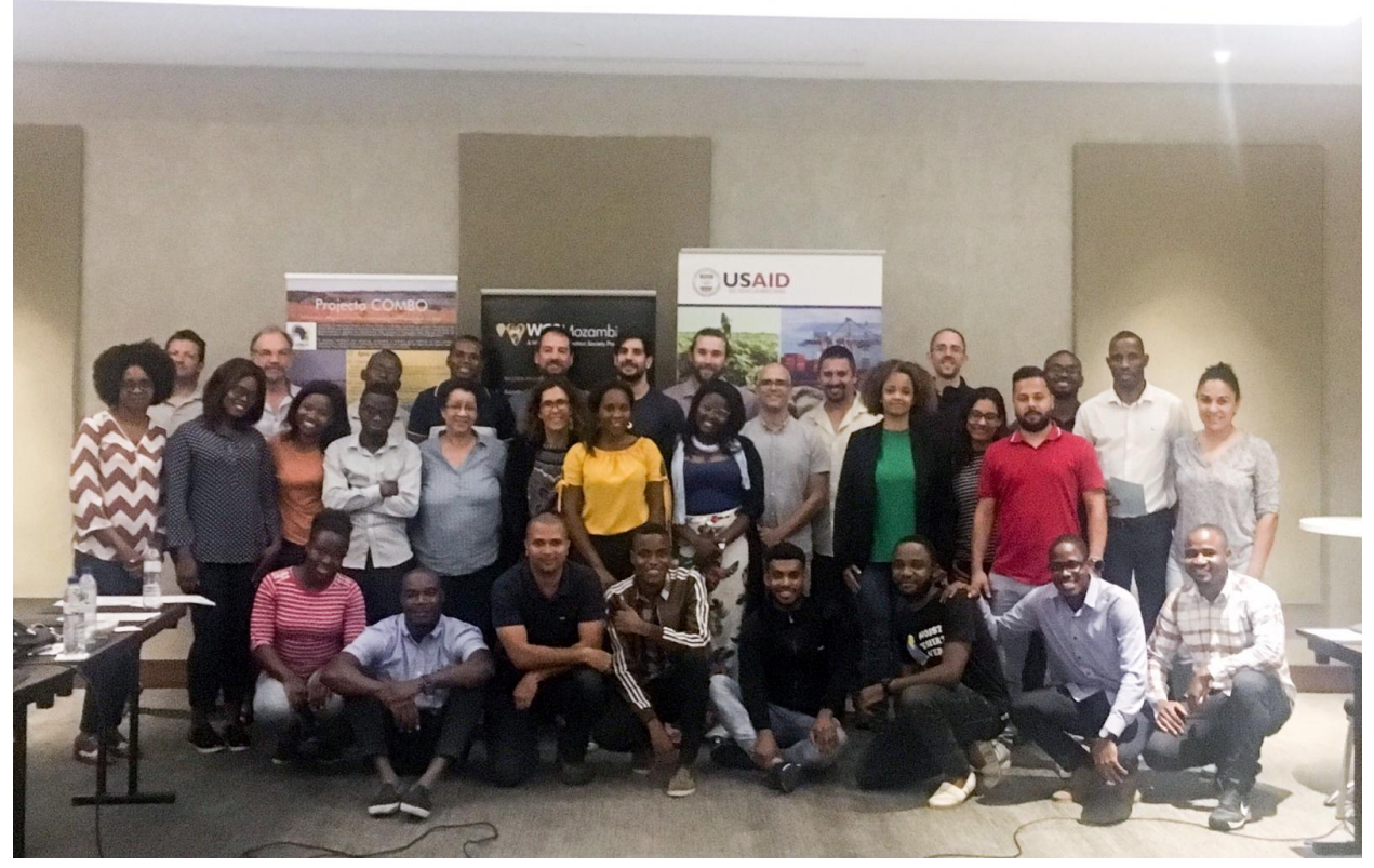
Photo 6: Participants who attended the Mozambique KBA delineation Workshop representing the various taxa experts and NCG members.