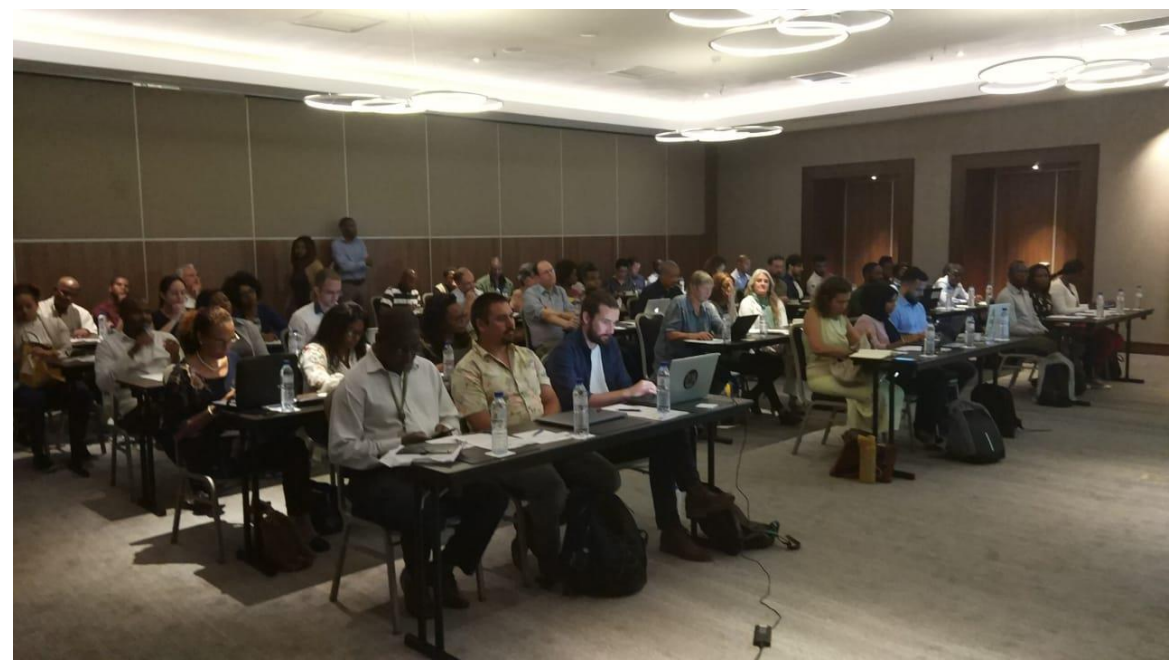
Photo 4: Participants attending a KBA delineation workshop in Mozambique.