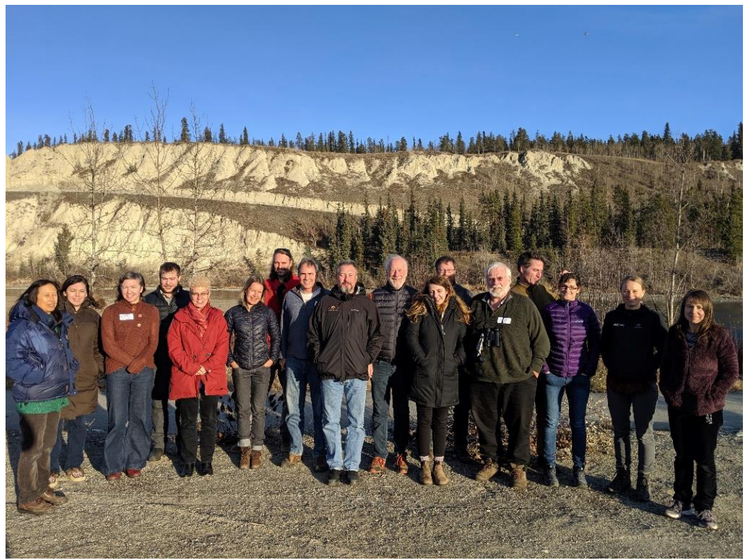
Photo 9: Members of the Canadian Key Biodiversity Areas initiative attending the first regional workshop in Yukon Territory from November 5 – 6 2019.